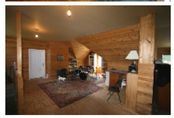
ERA Dawson Bradford 417 Main Street Bangor, ME 04401