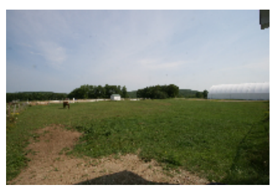
2552 Western Avenue, Newburgh